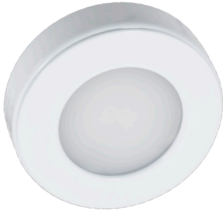
Tunable Omni Round - White 2.8W / 135Lm OMNI-TW-R1-WH