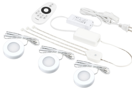
Tunable Omni Three Puck Kit - White OMNI-TW-R3-WH

Tunable Omni Three Puck Kits Include: (1) 24V DC plug-in driver/ (1) receiver with 3-port hub and remote control / (3) White Omni Tunable Pucks with 72" lead wires / Mounting hardware