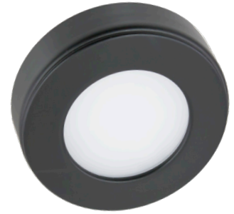
Tunable Omni Round - Black 2.8W / 126Lm OMNI-TW-R1-BK