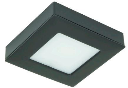
Tunable Omni Square - Black 3W / 140Lm OMNI-TW-S1-BK

Tunable Omni Single Pucks Include: (1) Omni tunable puck with 72" lead wire / Mounting hardware