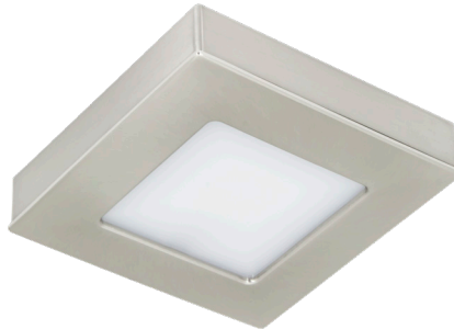
Tunable Omni Square - Nickel 3W / 145Lm OMNI-TW-S1-NK