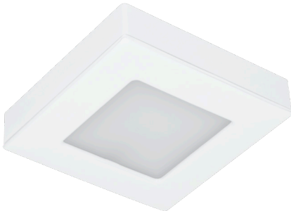
Tunable Omni Square - White 3W / 150Lm OMNI-TW-S1-WH