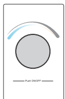
Push Dial Controller (Single zone)