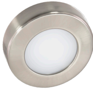
Tunable Omni Round - Nickel 2.8W / 130Lm OMNI-TW-R1-NK