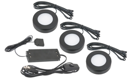
Three Puck Kit - Black OMNI-3KIT-BK

Omni Three Puck Kits Include: (1) 12V DC plug-in driver with 3-port hub and rocker switch / (3) Omni Pucks with 72" lead wires / Mounting hardware