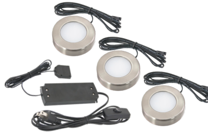
Three Puck Kit - Nickel OMNI-3KIT-NK