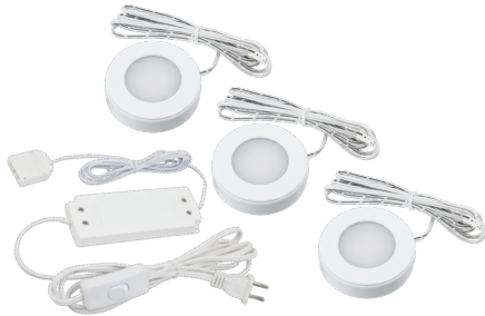
Three Puck Kit - White OMNI-3KIT-WH