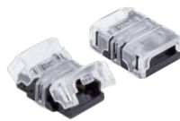
HD Splice (IP54) TL-2SPL-HD