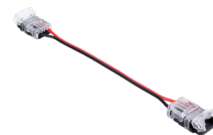
HD Linking Cable (IP54) TL-2JUMP6-HD (6") TL-2JUMP24-HD (24")