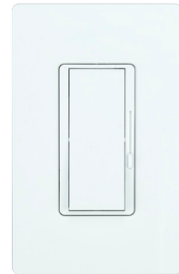
CL / ELV / TRIAC Standard Dimmer