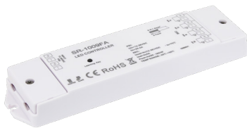
Trulux RF Receiver (Required per zone) REC-5A-4Z