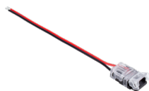
HD Power Feed (IP54) TL-2PWR-HD