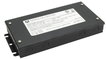
Adaptive 24V Drivers ADPT-DRJ-30-24 (30W) ADPT-DRJ-60-24 (60W) ADPT-DRJ-96-24 (96W) ADPT-DRJ-192-24 (192W) ADPT-DRJ-288-24 (288W)