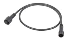
Linking Cable (IP65) TL-2JUMP65-.5 (6") TL-2JUMP65-1 (12") TL-2JUMP65-2 (24")