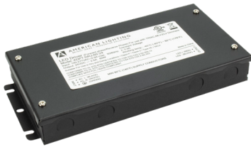
Adaptive 24V Drivers ADPT-DRJ-30-24 (30W) ADPT-DRJ-60-24 (60W) ADPT-DRJ-96-24 (96W) ADPT-DRJ-192-24 (192W) ADPT-DRJ-288-24 (288W)