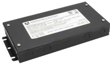
Adaptive 24V Drivers ADPT-DRJ-30-24 (30W) ADPT-DRJ-60-24 (60W) ADPT-DRJ-96-24 (96W) ADPT-DRJ-192-24 (192W) ADPT-DRJ-288-24 (288W)