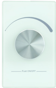
Single Zone Push Dial Wireless RF Wall Controller SRF-BATT