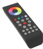
8 Zone Remote RF Remote Control RF-RGBW-3AAA