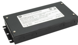
Adaptive 24V Drivers