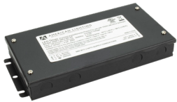
Adaptive 24V Drivers