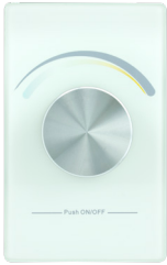
Tunable Push Dial Wireless RF Wall Controller