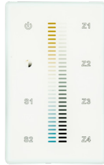
4 Zone Touch Slide DMX Wall Controller