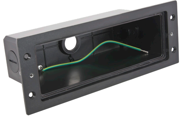
BRICK LIGHT ROUGH-IN HOUSING