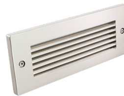
HORIZONTAL LOUVER STAINLESS