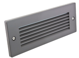
HORIZONTAL LOUVER DARK BRONZE