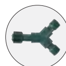
Y - Connector