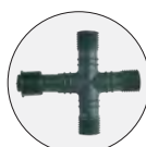
X - Connector