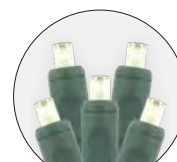
ULTRA WARM WHITE

Color swatches are for representation purposes only and may not depict actual product color