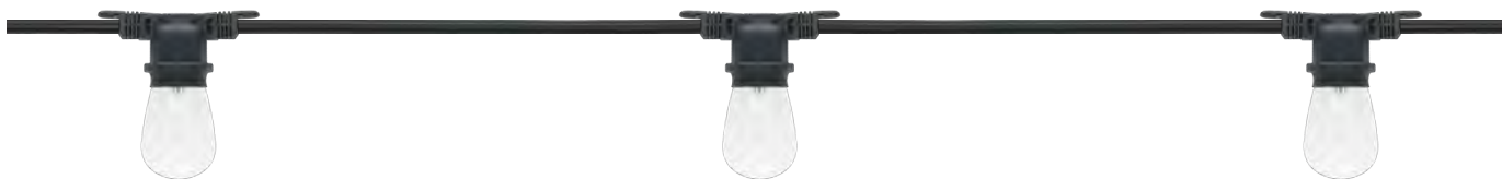
Shown for visual reference only - socket size or spacing may not depict actual product (Bulbs sold separately)